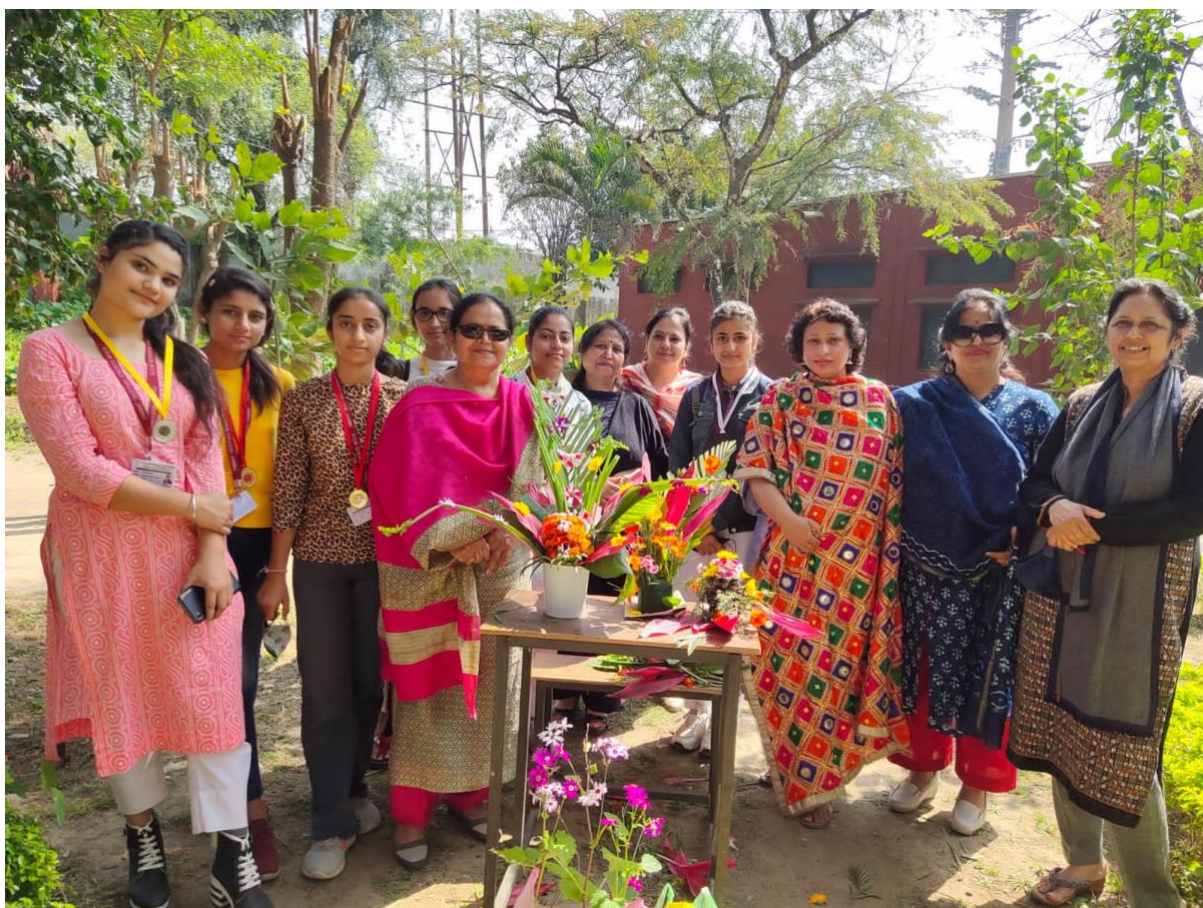
Number of teachers :All faculty members of Chemistry department